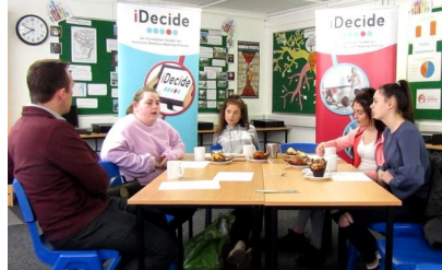
Student Focus Group