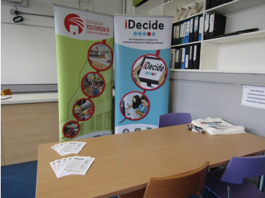
iDecide station at a recently held Parent & Teacher meeting